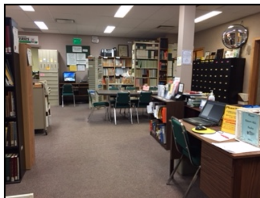
SGS Library and Research Room

Thank you to everyone who continues to donate mailing boxes, bubble bags and funds to help with postage costs. This helps ensure that library books can continue to be mailed out to members.